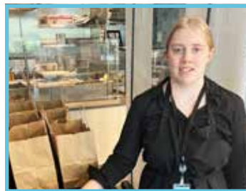
KATHERINE Compass USA/FactSet