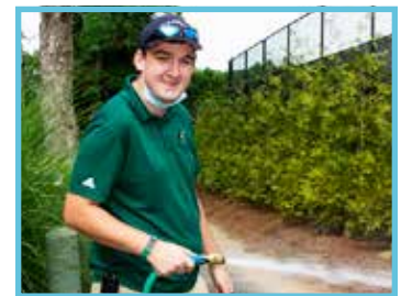
JACK Country Club of New Canaan