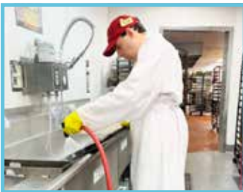
TALON Stew Leonard's

STAR has four staff members certified in Customized Employment through DDS who provide evaluations, training, and support that lead to meaningful jobs. Today, over fifty STAR participants are supported in jobs in the community with an average tenure of more than nine years. STAR is thankful to all local businesses that provide inclusive work sites for STAR participants. We welcome and invite more employers, who need reliable and able employees, to contact STAR for your next hire.