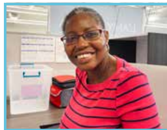
KAYWANA Lamy America