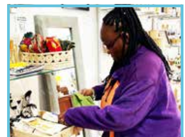
TRISH Eco Evolution