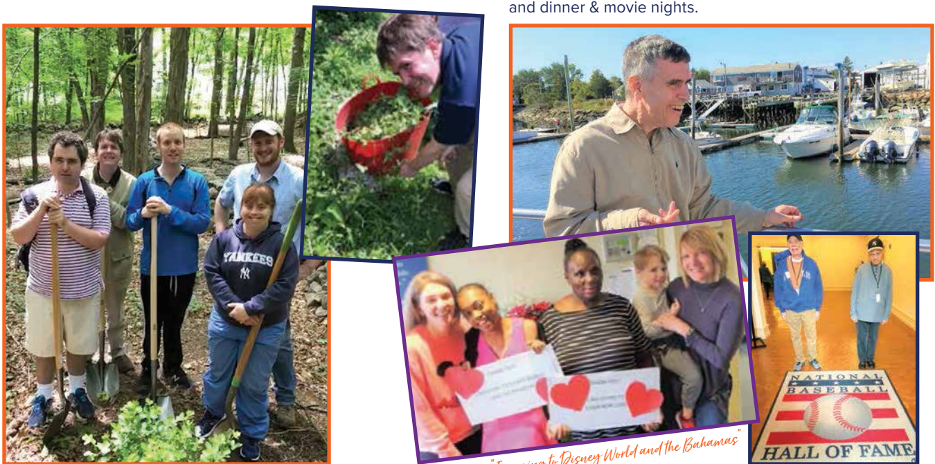
"I'm going to Disney World and the Bahamas"

Active STARS Over 337 STAR Recreation activities kept STAR participants on the move! In addition to vacation getaways, activities included Waypointe Adventures, Sports Buddies, fishing, concerts, Theater of STARS, and running with MyTeamTriumph. Many enjoyed garden club, book club, bowling, mini golf, bingo, woodworking, girls' salon night, and dinner & movie nights.