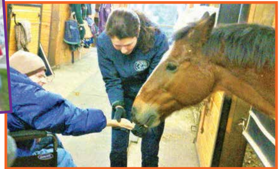
“He talks about this so much, it is surely one of the brightest lights in his life.”